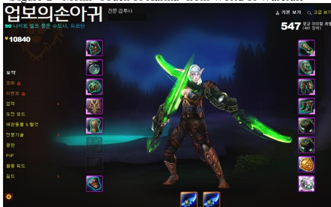
<Figure-2> Monk 'Touch of Karma' from World of Warcraft 46

The characters made by novelists are under legal protection, but the absence of the law regarding game characters has caused a theoretical conflict. 47