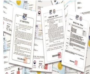
Patents(56nos.), New Technologies(3Nos.)