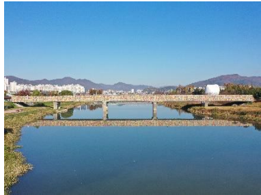
Complete Prj.(about 1,200nos. bridges)